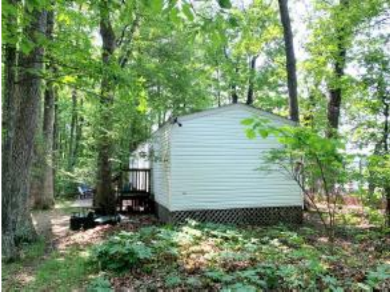
VIEW TO THE SOUTHWEST