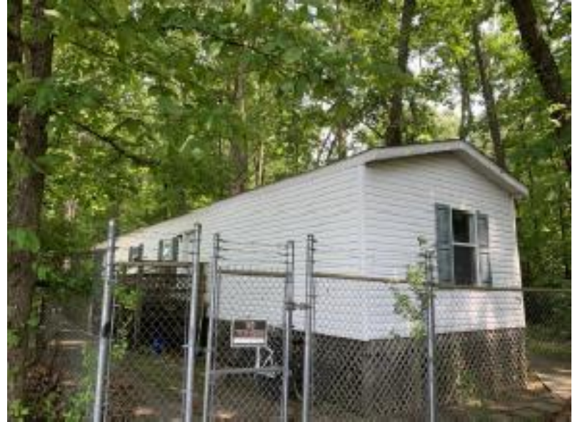
VIEW TO THE NORTHEAST